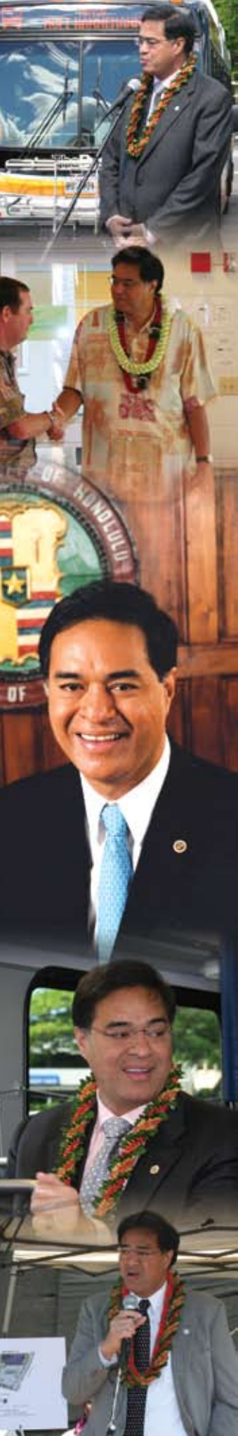
MUFI HANNEMANN MAYOR