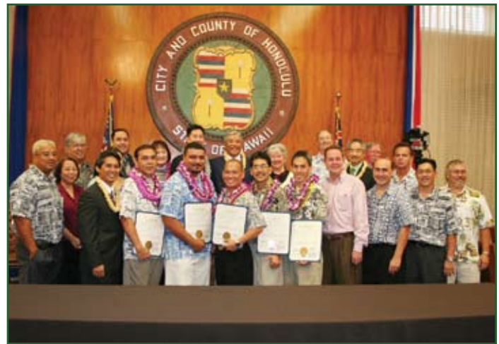
Photo Above (left to right): City Council, OTS and DTS officials pose with this year's Rodeo winners.