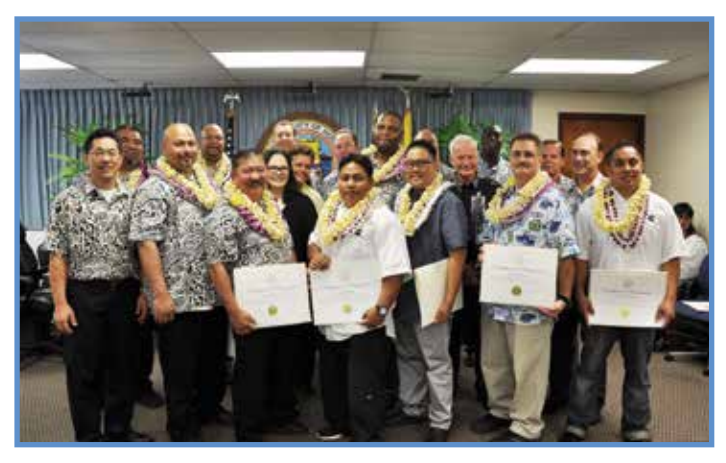
Photo above: OTS Roadeo winners honored by the Mayor of Honolulu Kirk Caldwell .