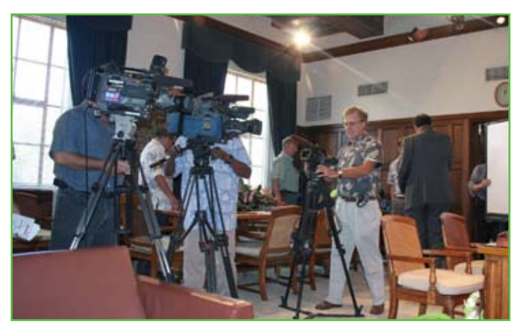
Photo Above: Local Media Stations setting up in the Mayor's office for the press conference.