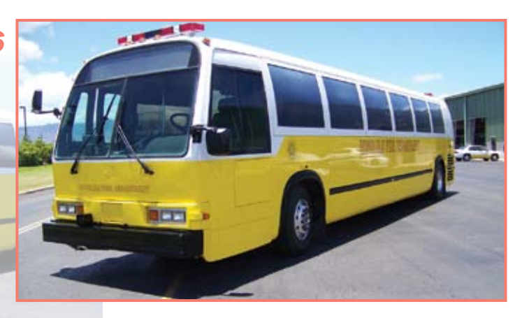
Photo Right: The bus that was donated to the Fire Department, it will be used to transport people and serve as a staging area for Firefighters. The bus was painted at the Pearl City Facility Maintenance Department.