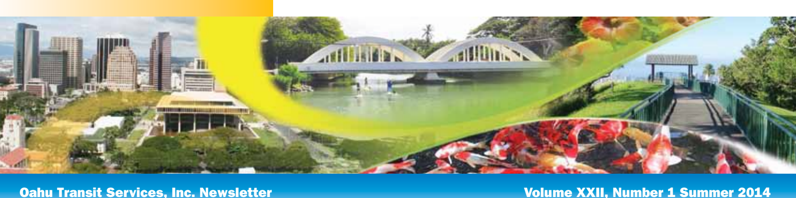
Oahu Transit Services, Inc. Newsletter