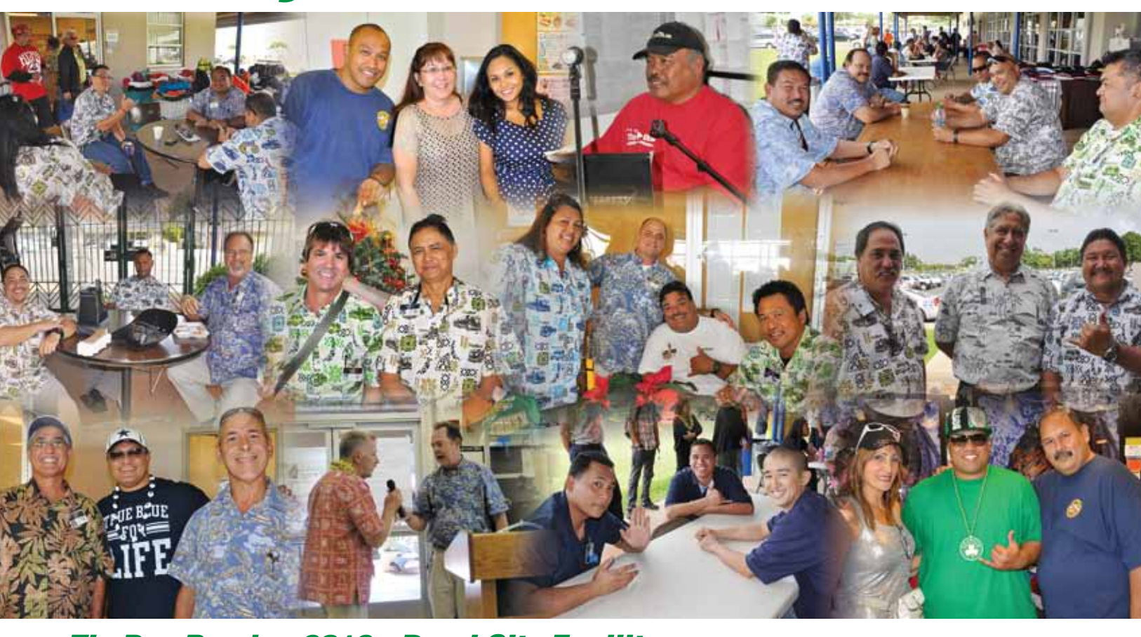
TheBus Roadeo 2012 - Pearl City Facility